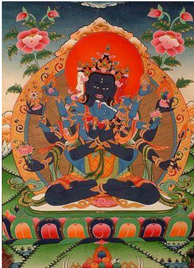
Guhyasamaja (Sangwa Dupa)