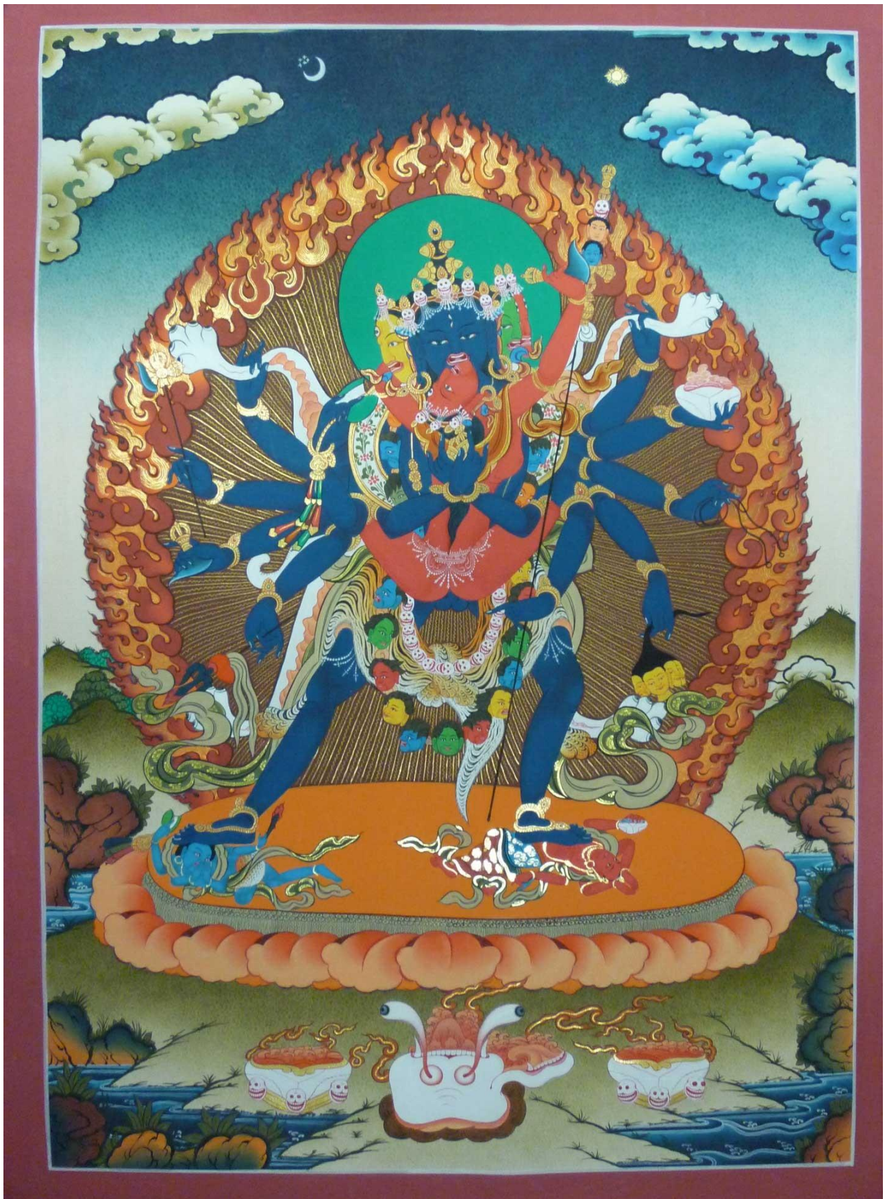
Chakrasamvara (Khorlo Dèrchok)