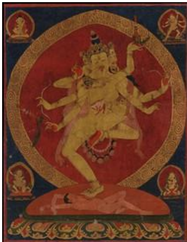
Mahamaya (Gyoutrul Chènmo)