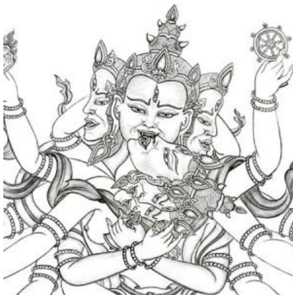
Guhyasamaja (Sangwa Dupa)