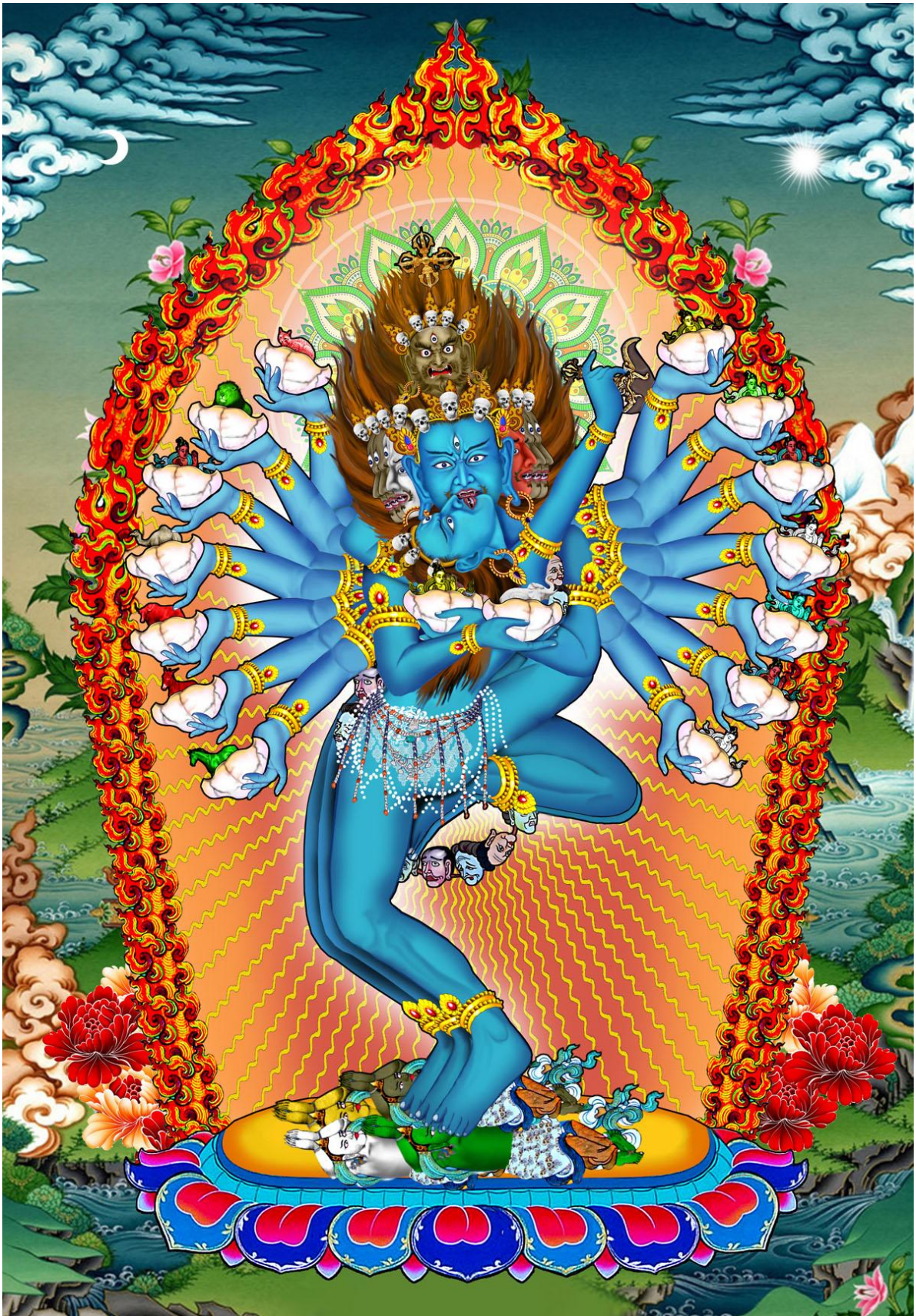
Hevajra – (Gyépa Dorje)