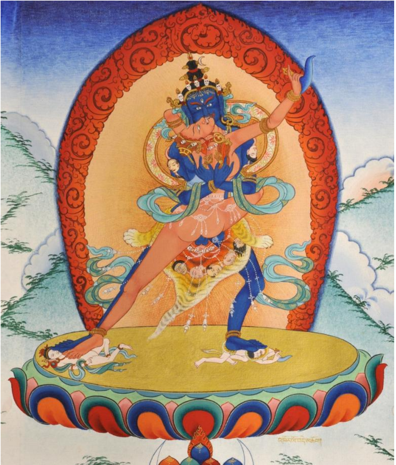
Chakrasamvara (Khorlo Dèrchok)