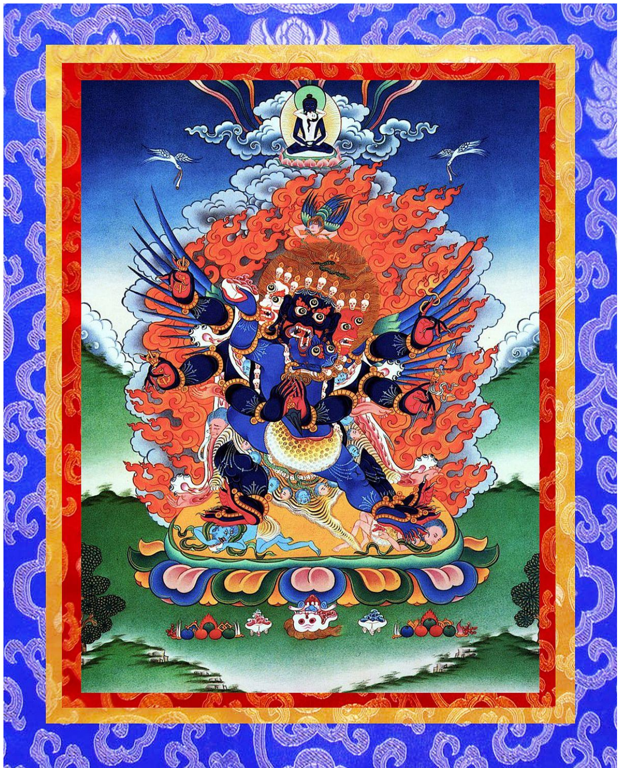
Vajra Kilaya (Dorjé Purba)