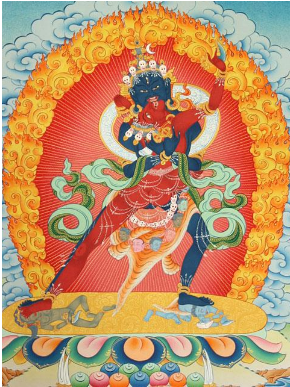
Chakrasamvara (Khorlo Dèmchok)