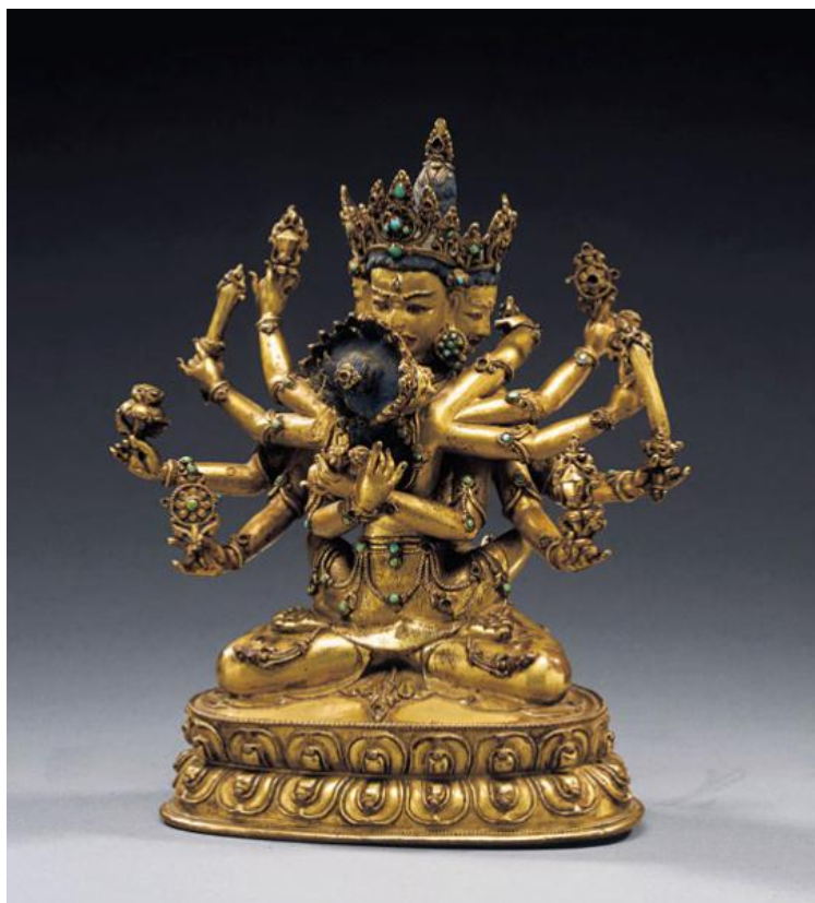
Guhyasamaja (Sangwa Dupa)